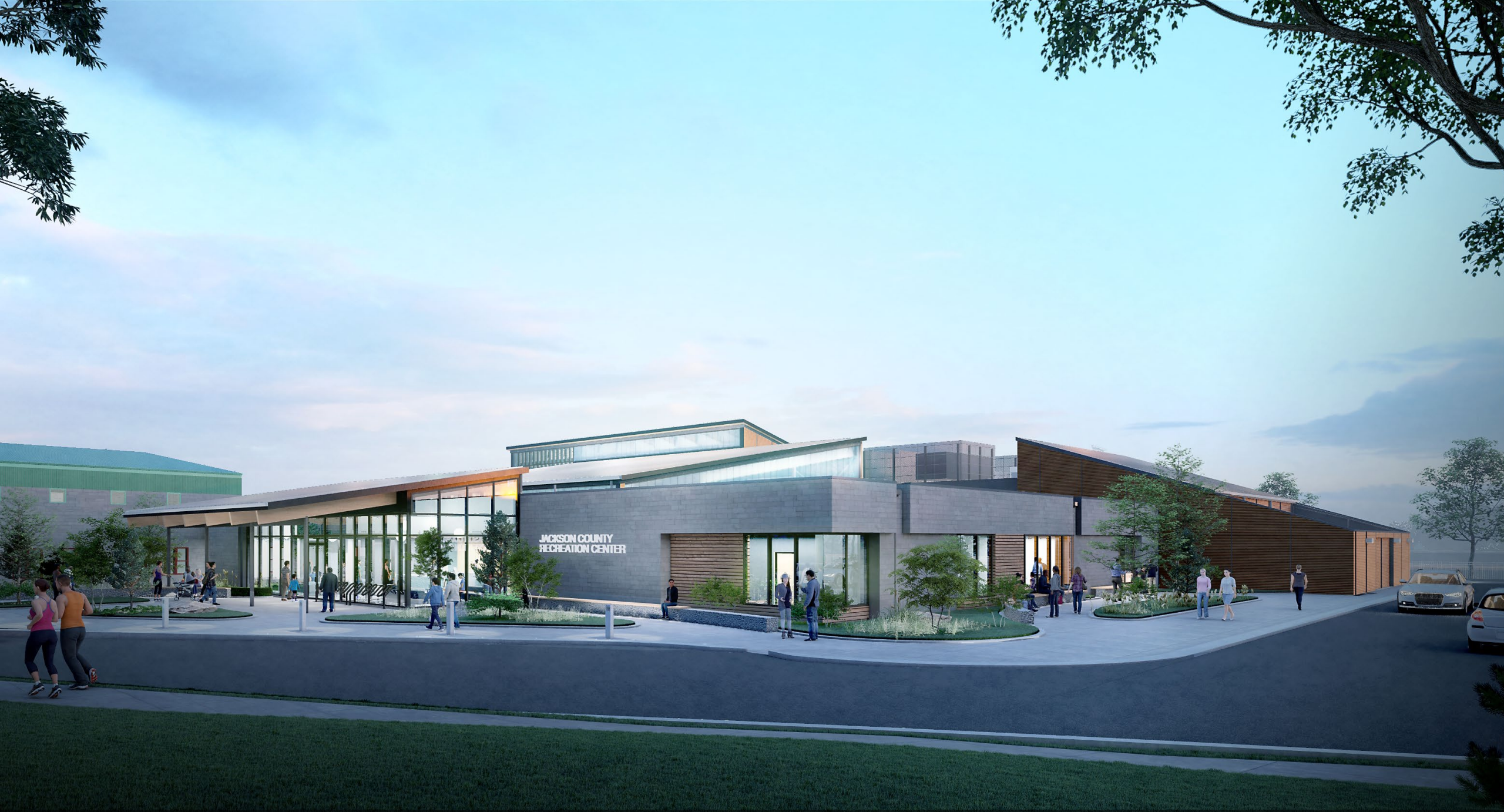
View From NE/ Cullowhee Mountain Road