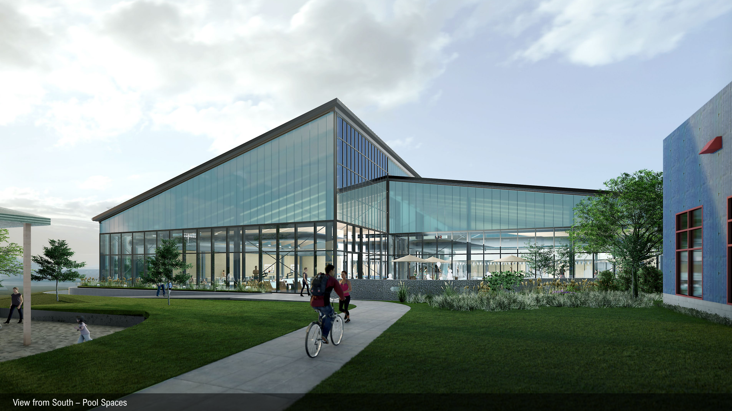
View from South – Pool Spaces